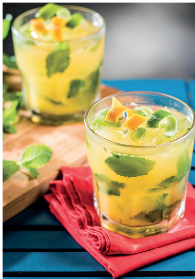
ARAK JULEP 44.

WHISKY, ARAK, MINT, CITRIC FRUITS (PASSION FRUIT, LIME, ORANJE) HONEY SYRUP.