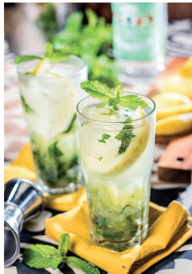
SHEIK'S MOJITO 48.

WHISKY, ARAK, MINT, CITRIC FRUITS (PASSION FRUIT, LIME, ORANJE) HONEY SYRUP.