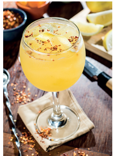
GIN SAJ 51.

RUM, MINT, GRAPES, LIME JUICE, ARAK, ORANGE TREE WATER AND SPARKLING WINE