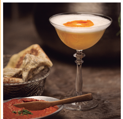
FARABBUD MOEMA 49.

GIN, ARAK, CHAI SYRUP, LIME AND TAMARIND FOAM