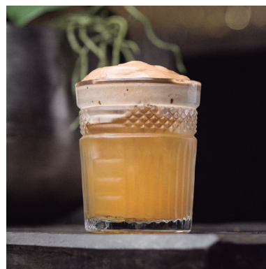
FARABBUD VILA NOVA 49.

VODKA, LIME, GINGER AND HANDMADE GRENADINE