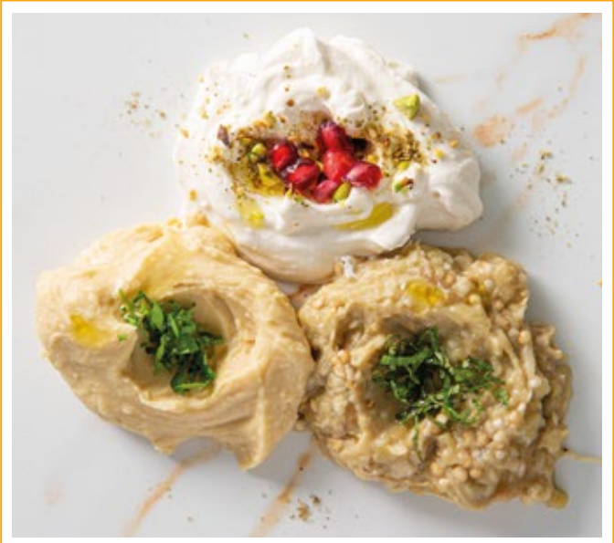
CAPTION: VEGETARIAN VEGAN