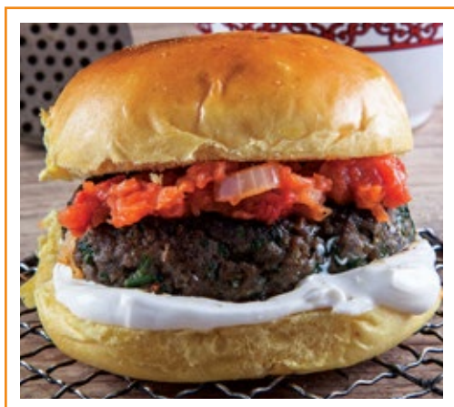
CAPTION: VEGETARIAN VEGAN

KAFTA BURGER, ONION SAUCE, TOMATO AND DRY CURD ON PARSNIP BREAD. SIDE ORDER OF RANDA POTATO.